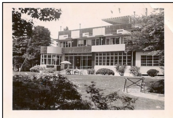
NWA Staff House in Tokyo

The main level, where NWA gave parties for visiting dignitaries, had a large living/party room, dining room, breakfast room and kitchen. The lower level held many attractions, including a cocktail lounge where people gathered in the afternoons, and a barber shop that catered to males and females, run by a Japanese barber. "Included with the haircut was a massage, beginning with the head and going down the arms. As he ended with the finger tips he snapped each finger, then laughed and bowed," Joyce remembers.