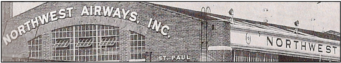
Holman Field, St. Paul, MN