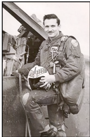
F-100 Training - Canon A.F.B.

It was his second retirement; the first was from the United States Air Force in 1980.